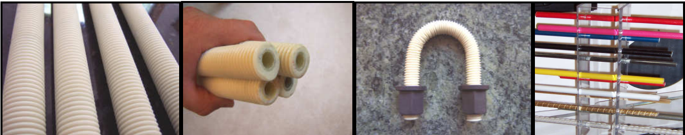
Tubes and Rods